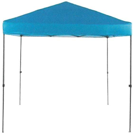
Open Tent Sample only