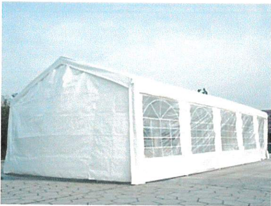
Medical Tent -Closed tent (Sample only)