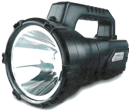
Rechargeable Portable Search Lamp