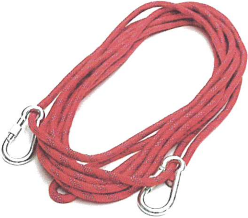
High Tension Rope