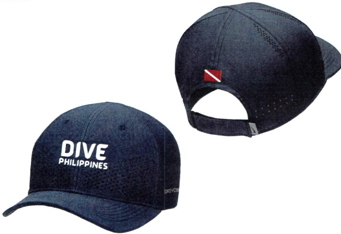
Blue dri fit cap